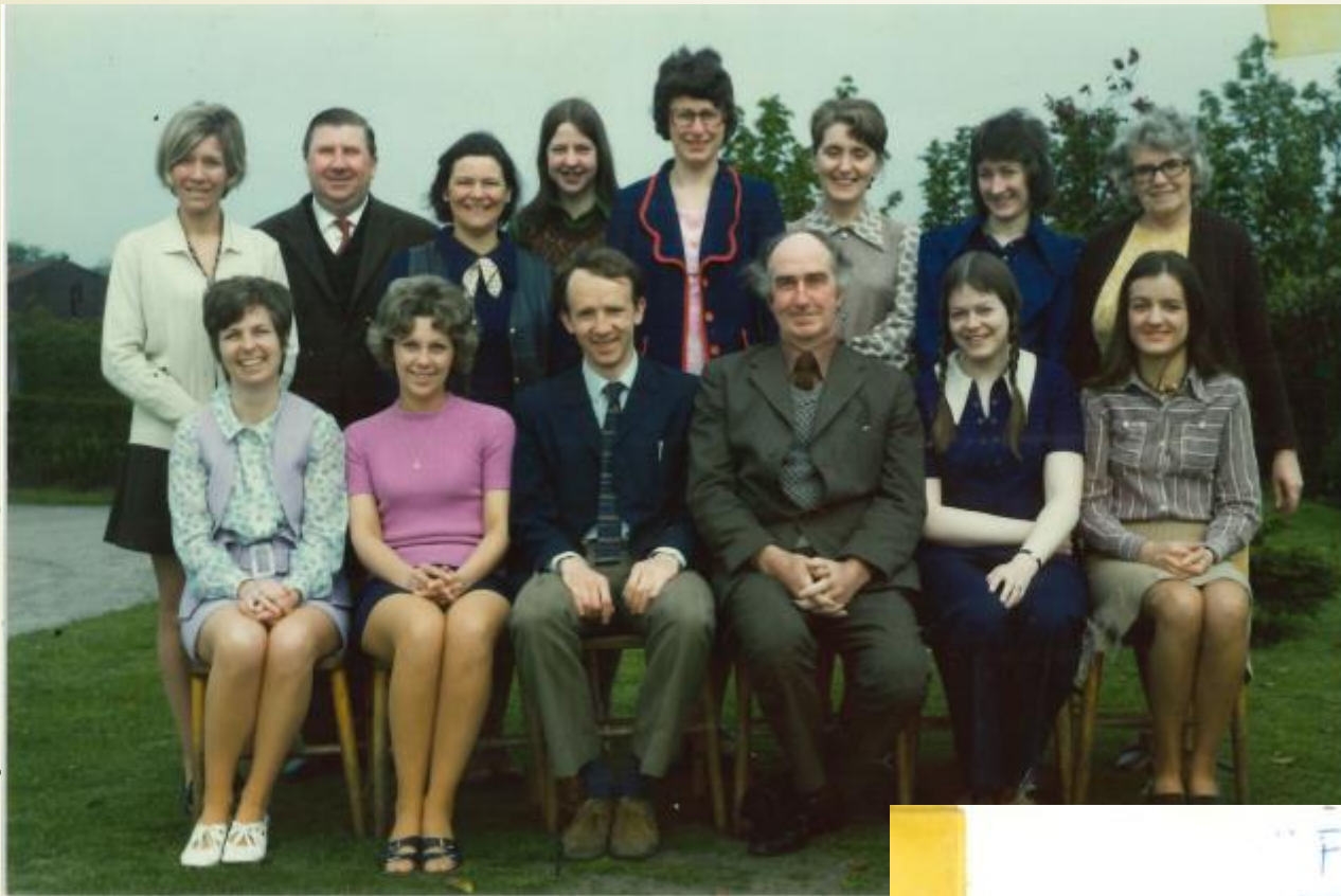
May 1975 Teachers at Five Ways Junior Mixed Infant School